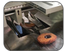
The Flow Wrapper 350T rapidly encloses the product in a tube of film before cutting and sealing the packages