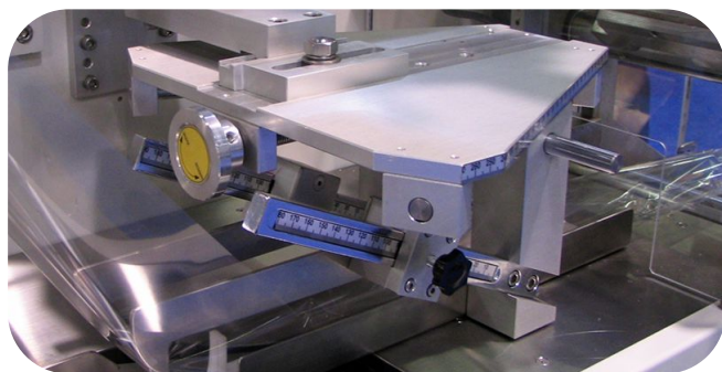
The deluxe adjustable former option for additional film shaping adjustability.