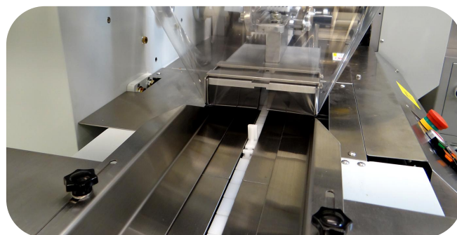
Delicate product conveyor with carrier card in-feed guide rails to handle product transitioning to the custom fixed former.

Carrier Card Guide Rails —Infeed guide rails to support carrier cards